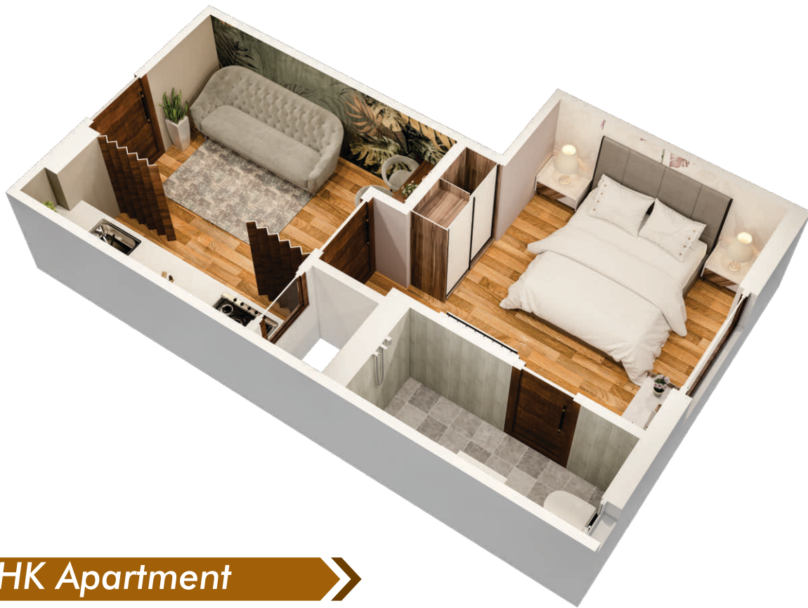
1 BHK Apartment