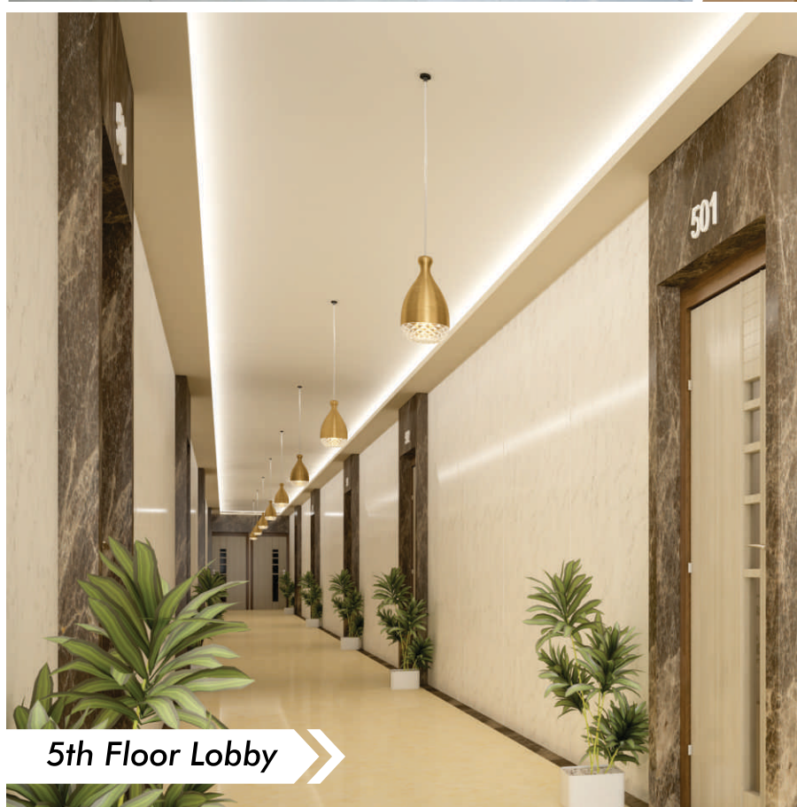
5th Floor Lobby