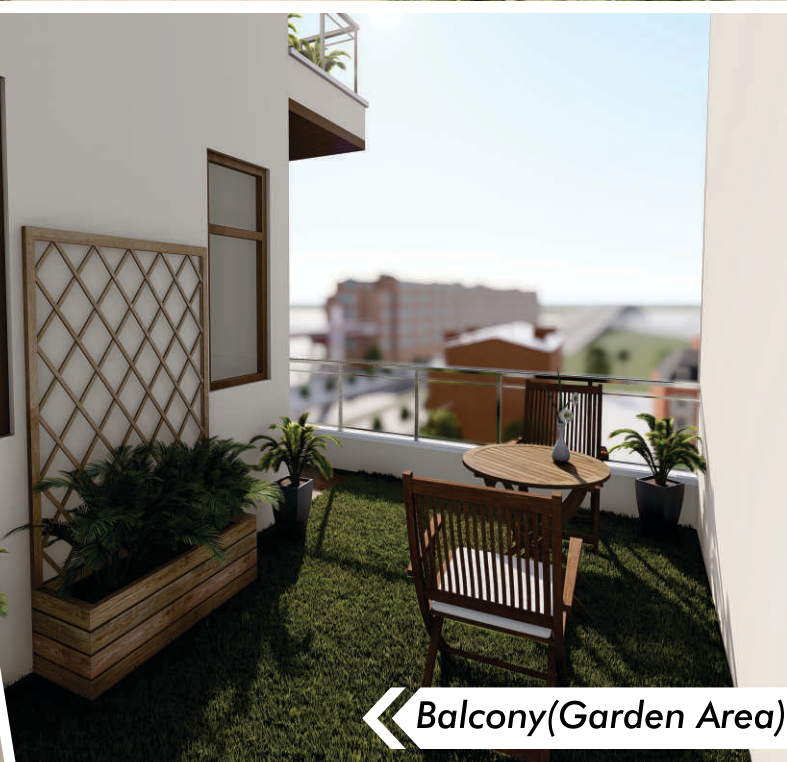
Balcony (Garden Area)